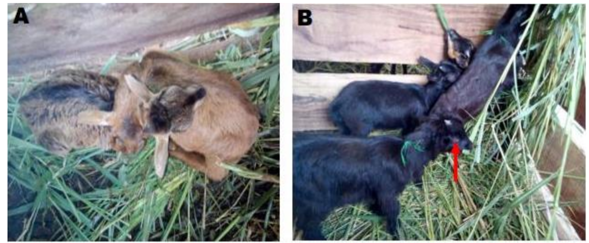
Figure 1: Kids experimentally infected with local isolates of Mycoplasma species (Panels A and B). A) Infected with M. ovipneumoniae , inactive and depressed 7 days post-infection. B) Ocular discharges (arrow) in a kid experimentally infected with M. arginini 7 days post-infection.